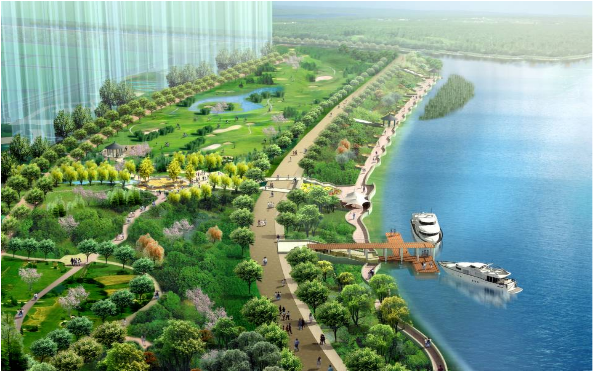
An Artist's Impression of the River Connection