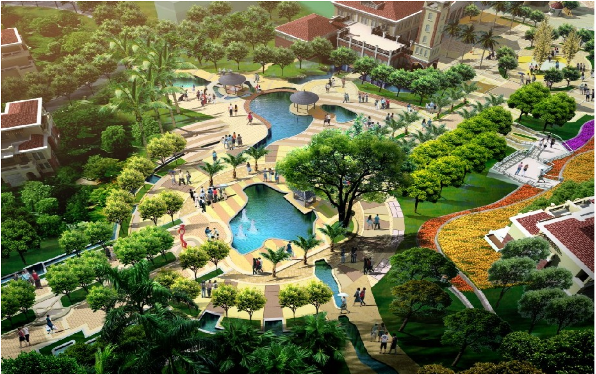
An Artist's Impression of the Common Area