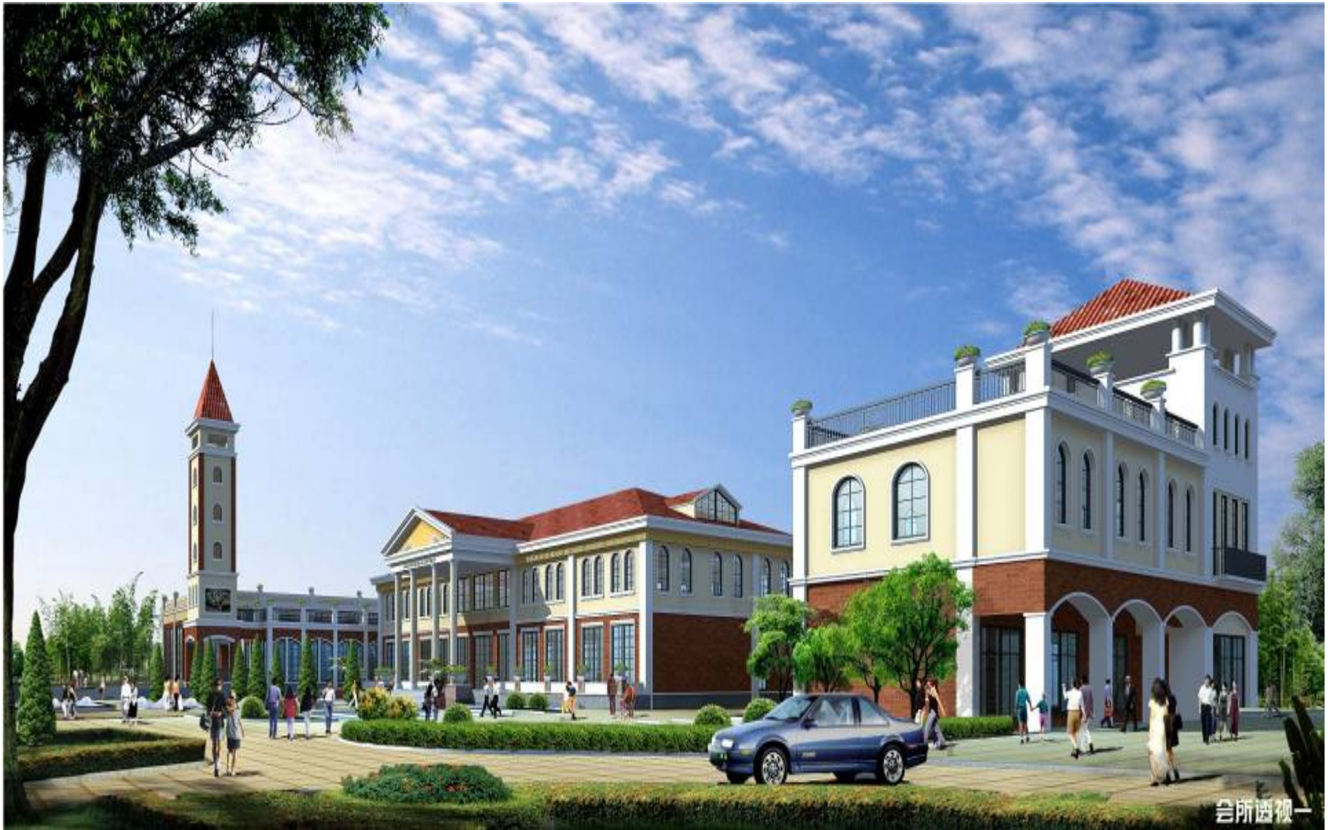
An Artist's Impression of the Main Administration Area