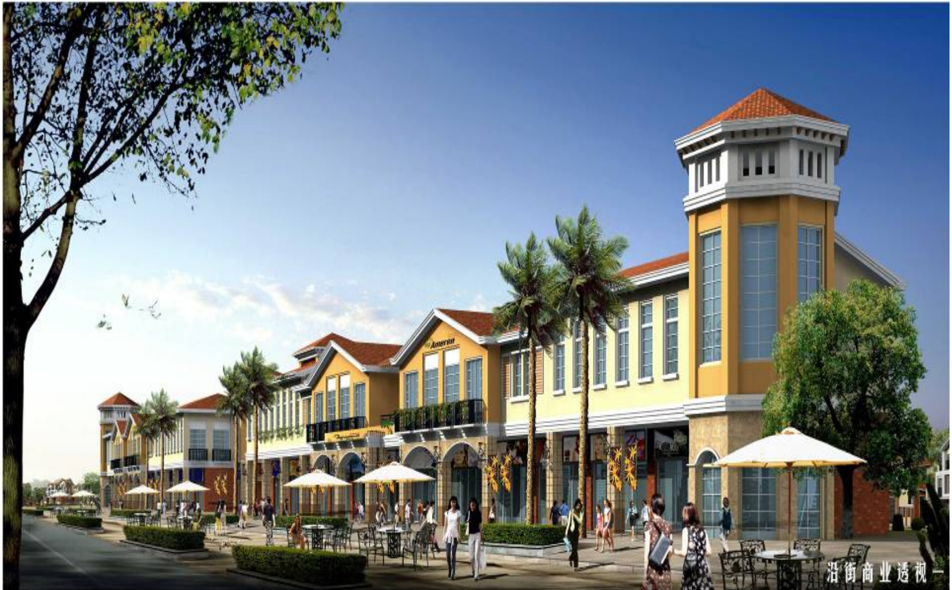
An Artist's Impression of the Commercial Street