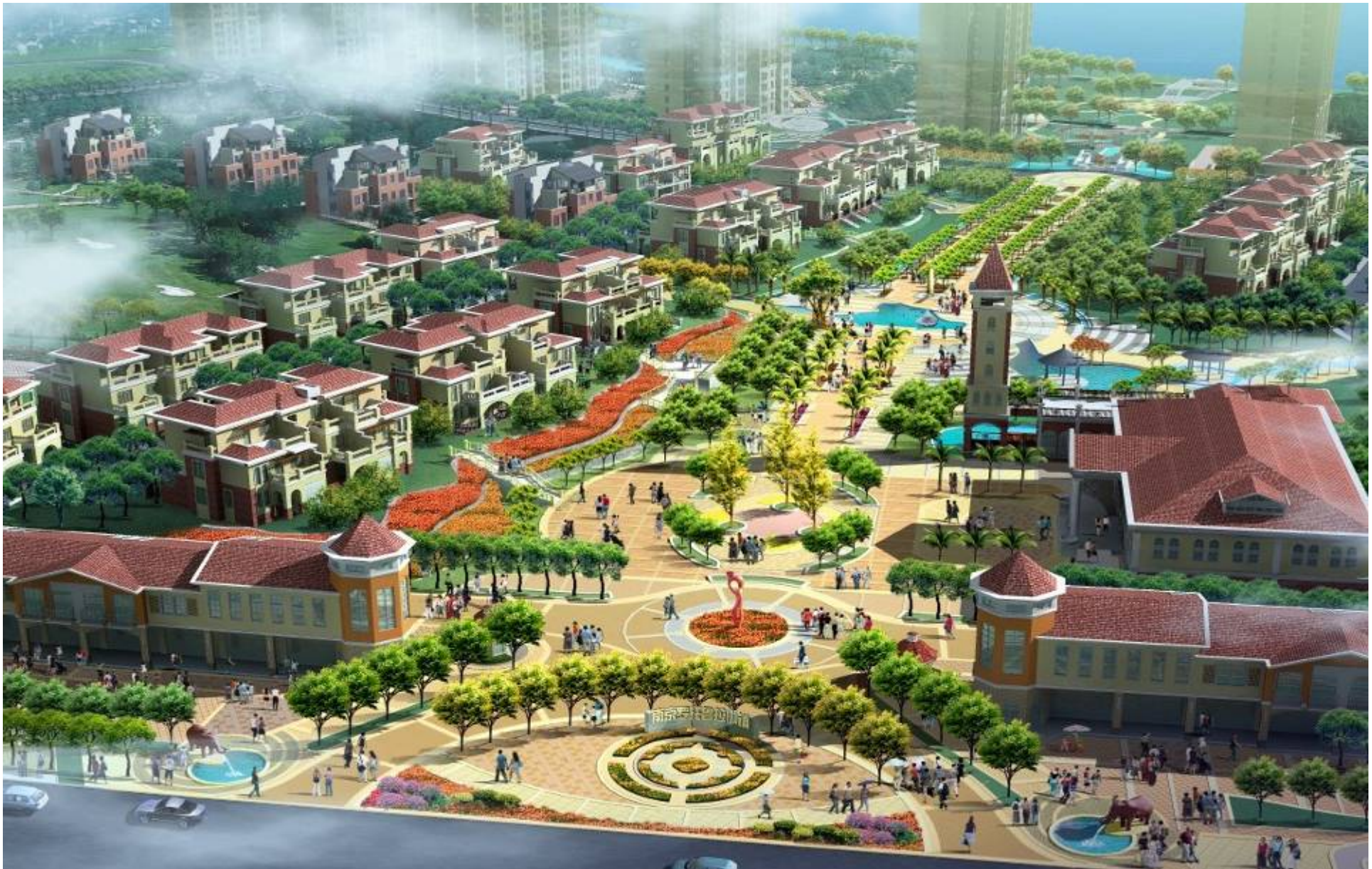
An Artist's Impression of the Main Centre of the Development