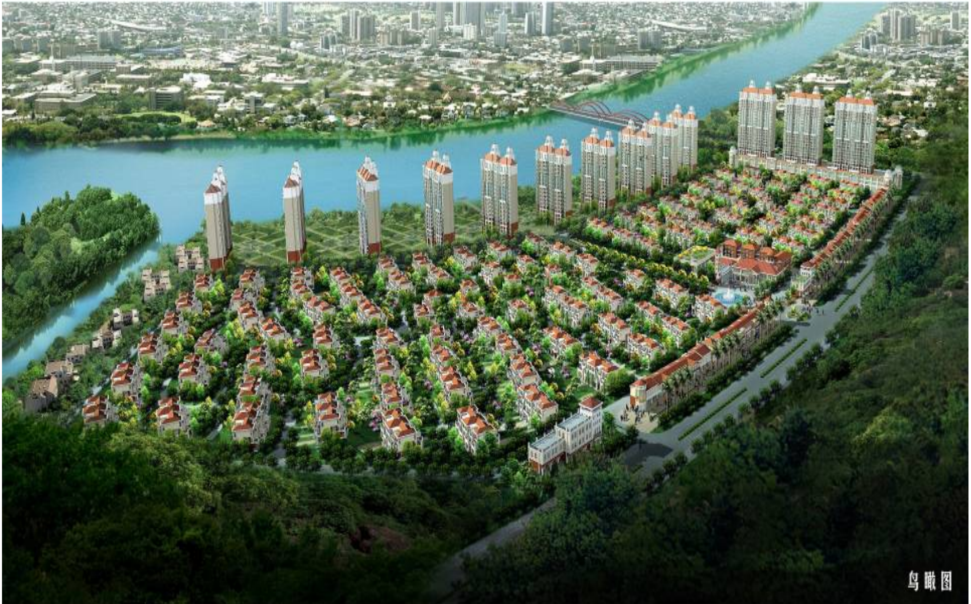
An Artist's Impression of the complete Nanjing Rotorua Town