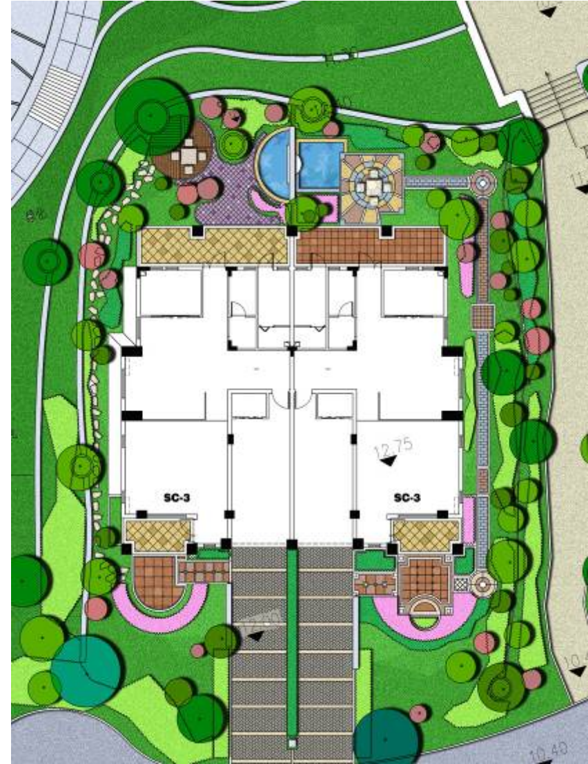
An Artist's Impression of the Villas for Sale Selling for NZ$250-300,000